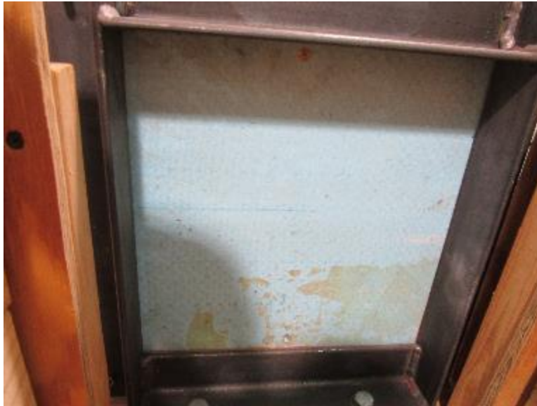
Photo No. 2 UL 752, Level 8, Pre-Test Interior