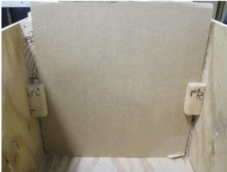
Photo No. 5 Post-Test Witness Panel