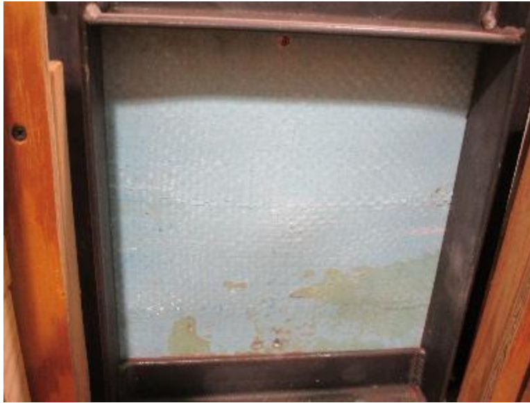
Photo No. 4 UL 752, Level 8, Post-Test Interior